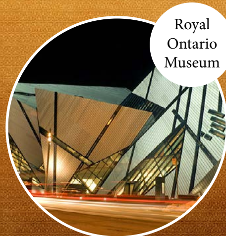
Royal Ontario Museum